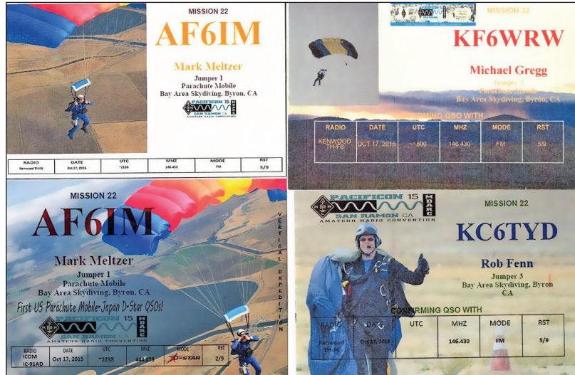
Figure 7 — Four custom QSL cards featuring photos from Mission 22.

There's even a connection between the jumpers and their APRS feed, which also tracks biotelemetry data, displaying their blood oxygen levels and heart rates. This