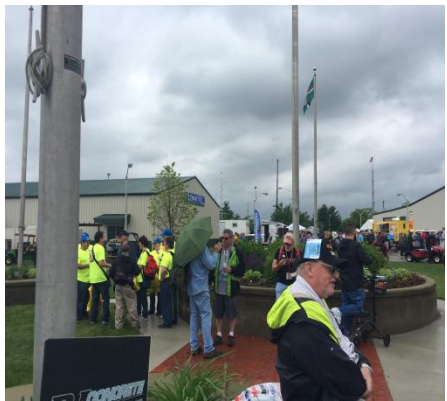
Figure 1 Dayton, yes bring your umbrella

The Dayton Hamvention® comes calling again after a hiatus of 2 years due to COVID-19, . This year celebrates the 70th year reunion (1952-2022) of the event when the first Dayton