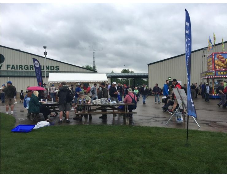
Figure 2 A lot of good eats available