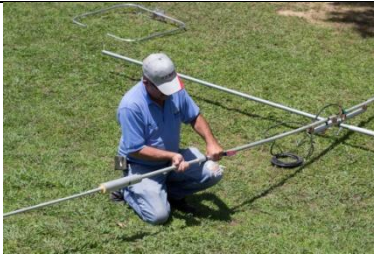
Paintsville ARC making final adjustments on antenna.

Well that is all the space we had for this month. Any other group have any photos of FD 2017. Will try to place them on the ARRL web site. I hope you enjoyed your FD and had plenty to eat this year. It appears we all are so undernourished. HI