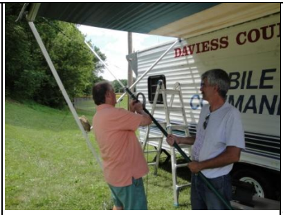
AA4RL and Club Pres, KJ4OND making antenna adjustments.