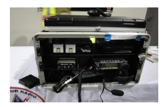
Figure 3Figure 2 1 of 2 Go Kits - ARES Hardin Co