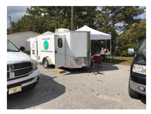
Figure 5 Letcher Co Hamfest

The club holds a Hamfest each year in April that draws in Hams from Kentucky, Virginia, and Tennessee. This year's Hamfest will be held Saturday April 14th from 8am to Noon in the Mountain Shrine Club at 95 Maryland Drive Whitesburg, KY 41858. Admission is $5 and tables at $10 for Hams wishing to sell items. Tailgating is free with one paid. This year the clubs goal is to grow interest in the 220 MHz band. That is why we are giving away a new TYT-9000D 220 transceiver and antenna. The club uses the East Kentucky 220 MHz linked repeater system along with the East Kentucky 2M