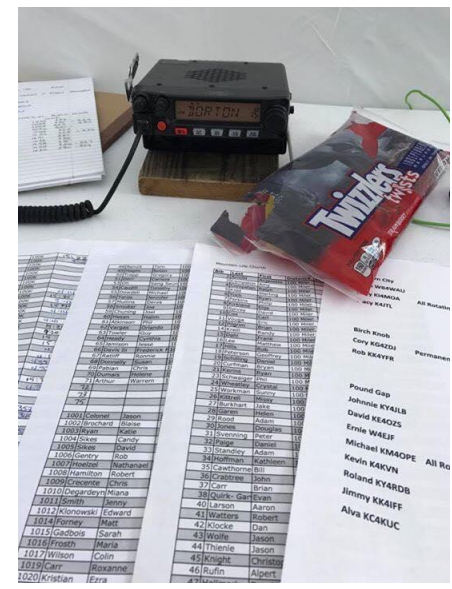
Figure 4 Field Day

For more info contact Roland Brown - KY4RDB. Ky4rdb@gmail.com or 6063353928