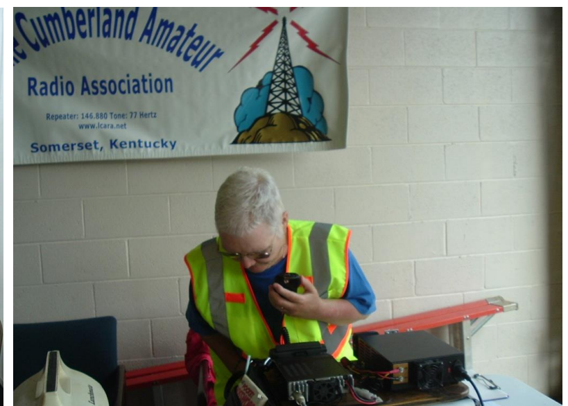
Figure 2 NCS for MT Victory Bike Race