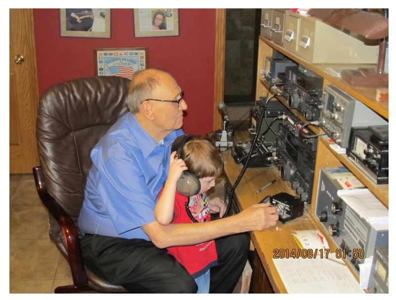
Figure 3 Bill, with his favorite pastimes

Deliberate Interference locally, to bird calls on an out of town repeater. I also tried to assist a repeater owner in broadcasting false distress signals.