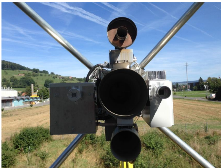
Looking at the business end of the “feed turret” shows how HB9Q puts the big 10-meter diameter dish to work. In the center is the 1296 MHz feed with the 2.3 GHz feed underneath. On top is the 3.4 GHz feed, at the right is the 5.76 GHz feed, and 10 GHz is on the left.

While change always results in various degrees of controversy, what was the outcome? Three weekends for EME action was just not enough! With so many stations adding and improving their microwave capabilities, there was a request to add more weekends for the bands at 2304 MHz (13 cm) and above in order to have more time to operate the five (or more) microwave bands popular for EME activity.