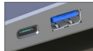
USB type-C (left) USB 3.0 (right)

Apple laptops running Windows 7 or newer under Boot Camp, Parallels Desktop, or VMWare Fusion are acceptable if they meet all other requirements. Laptops, netbooks, Chromebooks, and tablets running other operating systems are not acceptable.