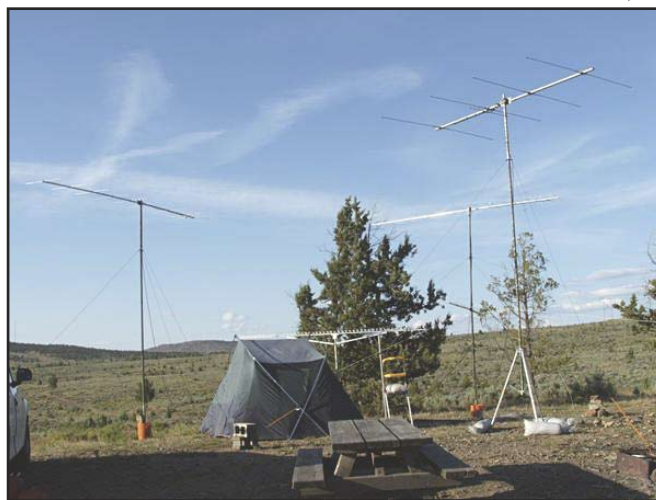
BRUCE JUNKIN, K17JA

Contact numbers on 144 and 432 MHz suffered due to all the effort single operators poured into their 6 meter time, yet there was enough activity to keep the scores of the well-equipped stations in the high scoring numbers with all of the points and multipliers that the higher bands provided. Six meter contact totals reported in the log submissions numbered over 143,000 — more than double the 2005 aurora-enhanced activity. Two meter contact numbers were down by 7000. Contacts on 222 MHz were about the same as last year, but 432 MHz had a drop of 2000. Contact numbers on the higher bands remained about