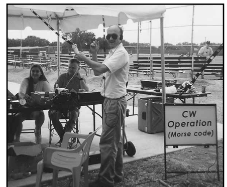
N5LF, KC5OJK, N2KTY and AB5EK try to decide how to utilize the neighboring softball netting for improving CW reception at the W5KA site.