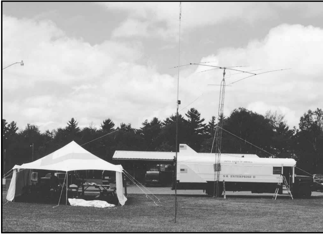
The Hiawatha ARA K8LOD attracted attention with the pseudo-shuttle at their Field Day operation.