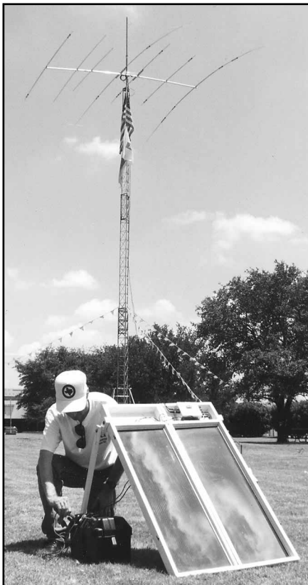
Solar panels for bonus points at W5VV.