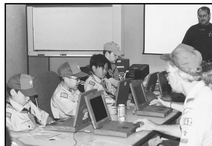
K7NWS provided a training school for its logging operators from Boy Scout Troop 342 of Federal Way, Washington.