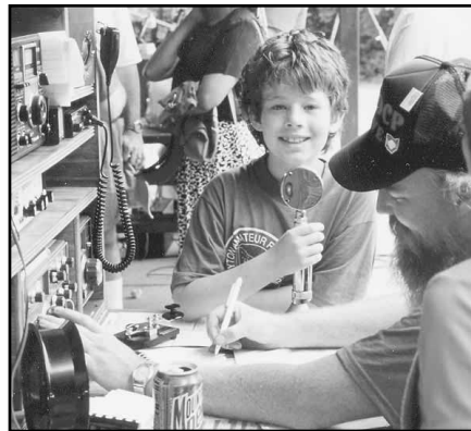
A young ham at the NO8I station prepares to use a microphone older than himself.

Keeping in mind the Field Day rules of "learning to operate in abnormal situations under less than optimal conditions," 27 amateurs descended on the NASJRB. We set up emergency antennas, developed a plan of operation, and for the next 12 hours