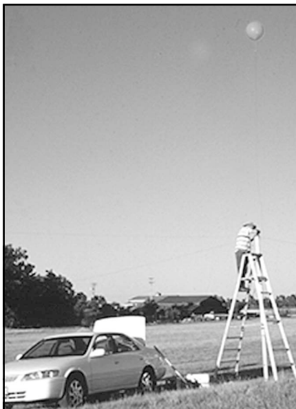
Peter, W6QEU, adjusts the balloon-supported 40-meter wire vertical at WR6WR.