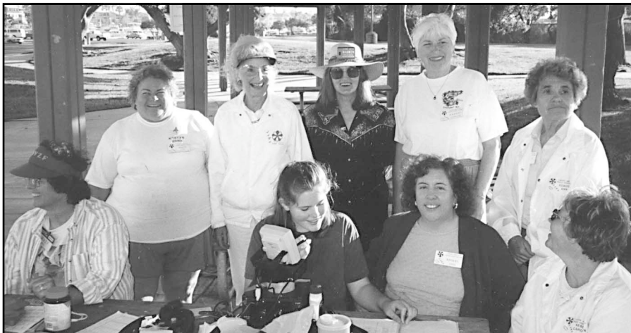
No, these aren't the YLs ready to set up the cover dish dinner for their OMs. These are the ops of the KØVA Ladies Amateur Radio Association of Orange County, California.