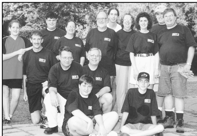
Boy Scout Venture Crew 73, K5BSA, at their Camp Whispering Cedars location in Dallas. ALCATEL USA of Richardson/Plano, Texas sponsors the Crew.