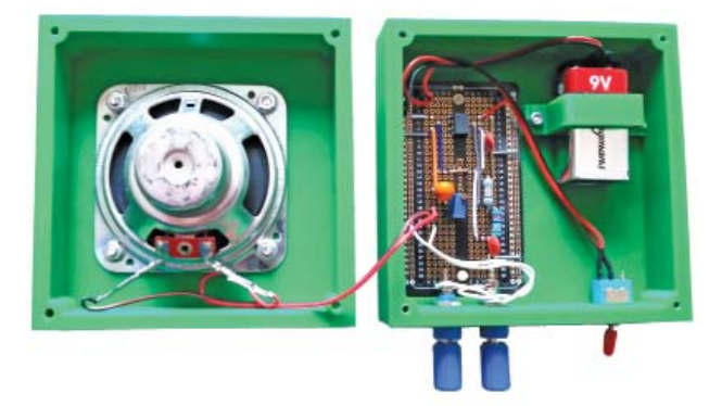
Figure 3 — The 3D-printed CPO housing consists of a base that accommodates the PCB, the battery with a clamp, the power switch, and banana receptacles for the keyer. The cover houses the speaker.

My vintage J-38 straight key required some work to clean the contacts and make it operable. If you look around at hamfests or on eBay, you can find a key for about $20. MFJ Enterprises sells a model with a stamped metal key on a plastic base for $34.95 (https://mfjenterprises.com/collections/cw/prod ucts/mfj-550). Any commercial key can be used (except for paddles because they're used only with an electronic keyer), as it's a simple switch and doesn't require any special considerations. The key I used is