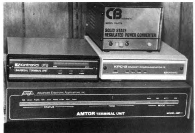
Fig 5—A mound of modems; the AMT-1 is at the bottom.

Textalker will not usually speak unless it sees a carriage return. Written into Talking Transend (and the program I am writing) is a time-out feature. 15 After a certain length of time, Talking Transend will force the characters accumulated in Textalker's buffer to be spoken even if a carriage return is not sent. I can change this