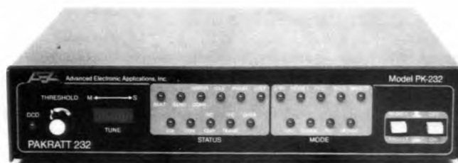
Fig 6—The AEA PK-232. In addition to CW, RTTY, AMTOR and packet-radio modes, current versions of this modem also provide for HF WEFAX reception.

You'll also need to install the memory backup batteries so that the parameters that you have set won't "go away" when you turn off the PK-232. Remove the cabinet top by taking out two screws in the back and two on each side. (The top, back and sides of the cabinet are one piece.) Take care you don't move it too far—wires from the battery holder, which is fastened to the top of the cabinet, lead to the circuit board. Just lift the top of the cabinet up and toward the back. You'll find a battery holder that holds three AA cells. If you're looking from the front of the box toward the back, install the cells this way: With the front of the PK-232 toward you, and the top of the cabinet lifted up and toward the back, the cell to the right is inserted with the positive terminal up. In other words, the positive terminal will be toward the front of the unit when it's put back together. The middle cell is inserted with the positive terminal down or toward the back. The left-hand cell has its positive terminal up or toward the front. When you put the top back on the cabinet, be sure that the miniature phone jacks on the back line