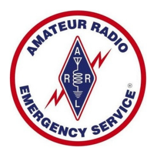
ARES Strategic Plan

The Amateur Radio Emergency Service<sup>®</sup> (ARES<sup>®</sup>) has held to the same precepts virtually since its inception in 1935, encouraging participation by any licensed Amateur Radio operator with a sincere interest in Public Service Communications. With the advent of more uniformly functioning public safety organizations across the nation, more requirements imposed upon agencies and organizations assisting them, and the development of the Incident Command System (ICS) and The National Incident Management System (NIMS), ARRL was challenged to align the standards of ARES with current needs of our served partner agencies.