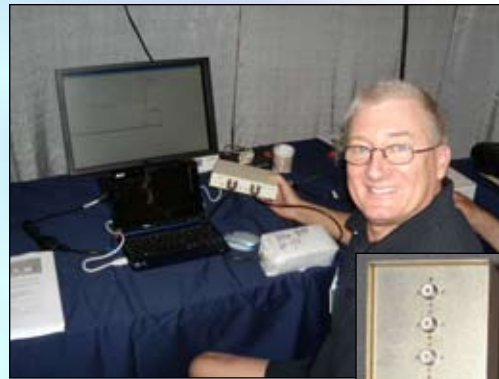
Array Solutions VNA

Array Solutions also introduced an 8 \times 2 matrix coax switch. This switch allows any of up to eight antennas or other loads to be switched to either of two radios.