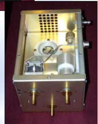
Palstar 2 meter RF deck