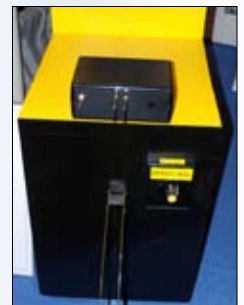
West Mountain P1