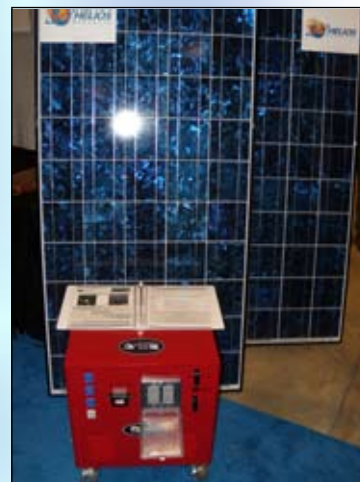
Helios solar power back-up

Helios Electric offers a self-contained solar back-up power system available through Array Solutions. This modular unit includes solar panels, charge controller, storage batteries and an inverter. It is expandable by adding solar panels — starting with two panels at 380 W capacity. It can be tied into a commercial powered system for backup service, or used as a stand-alone unit at portable or emergency locations. In addition to 120 V/60 Hz, 12 V dc can be made available for battery type loads.