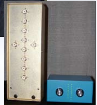
Array Solutions coax switch.