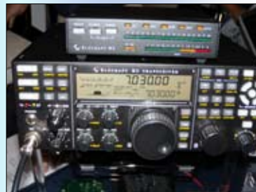
Elecraft W2 wattmeter

Elecraft introduced a new wattmeter, the W2. This unit operates with up to two remote sensors, available optimized for HF through 54 MHz at 200 and 2000 W levels or for 144 to 450 MHz at 200 W maximum. The W2 is available fully assembled, or as a no-soldering semi-kit. It provides power and SWR readings including peak or peak hold measurements. Control features are provided to allow disabling an amplifier, for example, if normal measurements are exceeded.