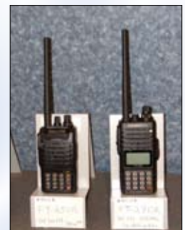
Yaesu hand held transceivers

Yaesu introduced two new handhelds. The FT-270 is a 5 W, 2 meter transceiver that is submersible to 3 feet for 30 minutes and is said to be built to commercial standards. The FT-250R