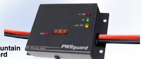
West Mountain PWRguard