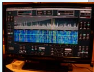
FlexRadio PowerSDR radio operating software