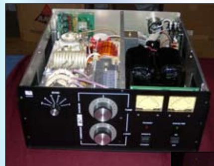
Command Technologies HF-2500