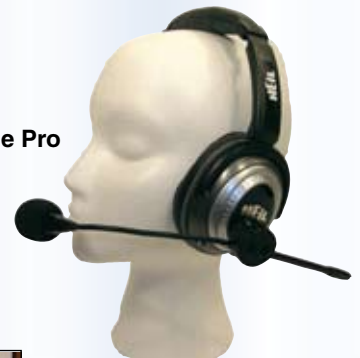
Heil Quiet Phone Pro

The headset offers a selection of optional microphone boom assemblies. Removing the small rubber plug above the ON/OFF switch exposes a brass insert that allows attaching one of five available boom assemblies with different mic elements.