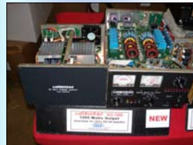
Ameritron ALS 1300