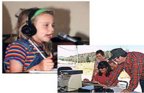
Fun for All Ages

and around the world. They communicate with each other using voice, computers, and Morse code. Some hams bounce their signals off the upper regions of the atmosphere, so they can talk with hams on the other side of the world. Other hams use satellites. Many use hand-held radios that fit in their pockets.