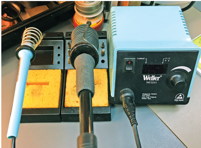
Figure 2 — The Weller model WM120 Mini Iron is on the left, and the model WES51 soldering station is on the right.

Afterwards, I return to the first pin and re-solder the connection.