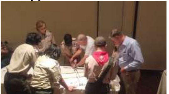
Scouts at the Duke City Hamfest designed and constructed a hand-held antenna and intercepted signals from LEO Satellites during the event.

This month many Scouting enthusiasts participated in the Jamboree On The Air, Many potential amateurs were present at sites throughout the USA to celebrate using Amateur Radio not just as a means to communicate, but a method to develop friendship and understanding. The ARRL-AZ Staff made many contacts with stations here in Arizona, as well as across the USA sharing activities, and making friends. Thanks to all the Scout-Leaders and volunteers that coordinated and participated, to introduce many youth to the excitement of our activities.