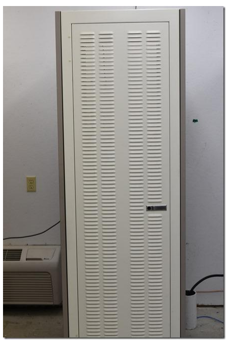
Figure 1 UHF REPEATER