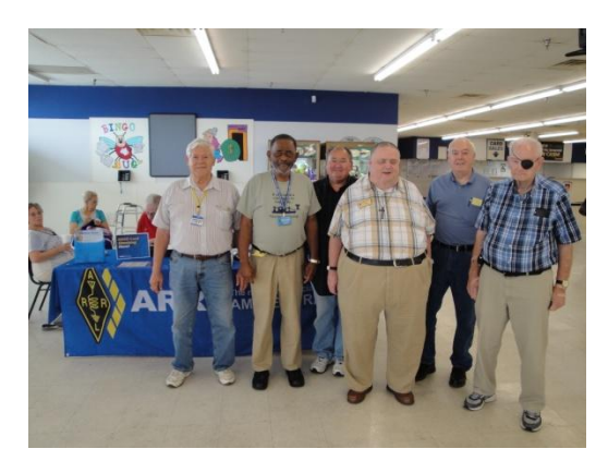
Figure 4 Louisa Club Members