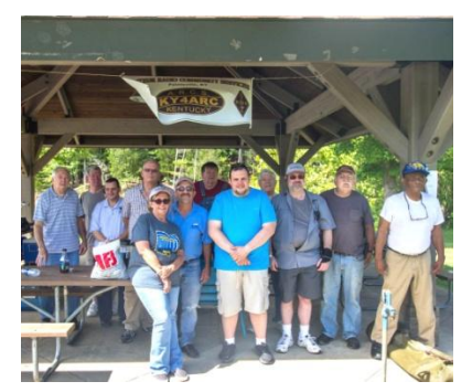
Figure 1 Paintsville ARC Group FD