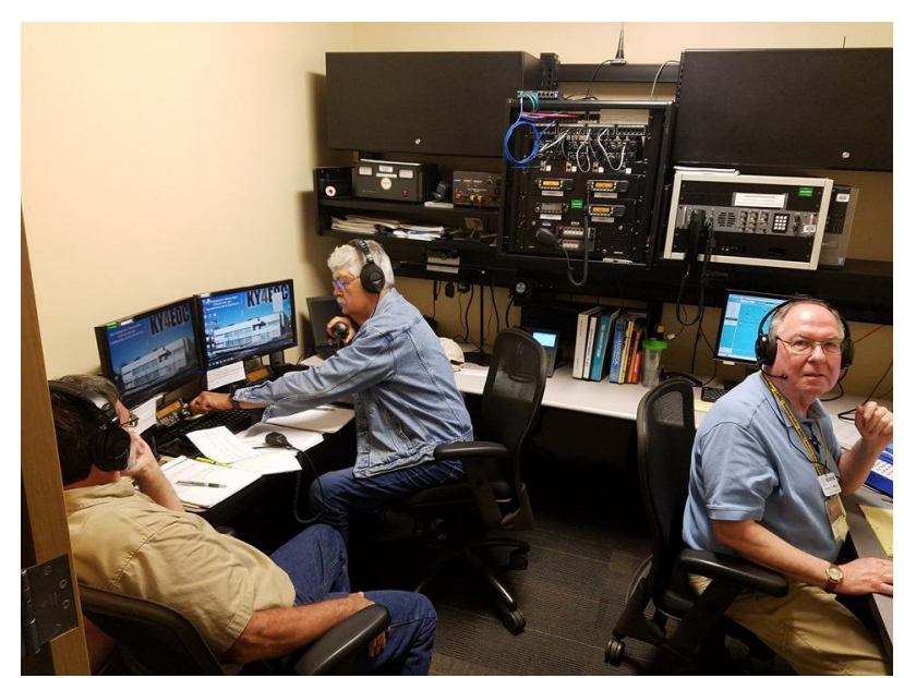
Figure 1 Frankfort KY4EOC CREW

If the exercise takes place in the future, there are many aspects of the exercise that never developed. It is hopeful that this may be developed in the future. It was my intent to only use the digital modes, such as DMR, Fusion and DStar for logistical and coordination use for the exercise. What happened during the exercise, all of normal operating channels