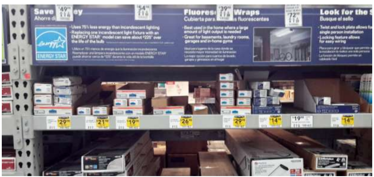
Figure 4.1 – Consumer and non-consumer ballasts on display at the Lowe's store in Newington, CT. This is similar to the other Lowe's stores in this report.

As can be seen in Figure 4.1, the consumer and non-consumer ballasts in this store were in a somewhat apparent order. Non-consumer ballasts were on the left. Consumer ballasts were on the same shelf and to the right of the non-consumer ballasts. This is similar to other Lowe's stores that we investigated. The ballasts were adjacent to each other and differentiated by a color scheme.