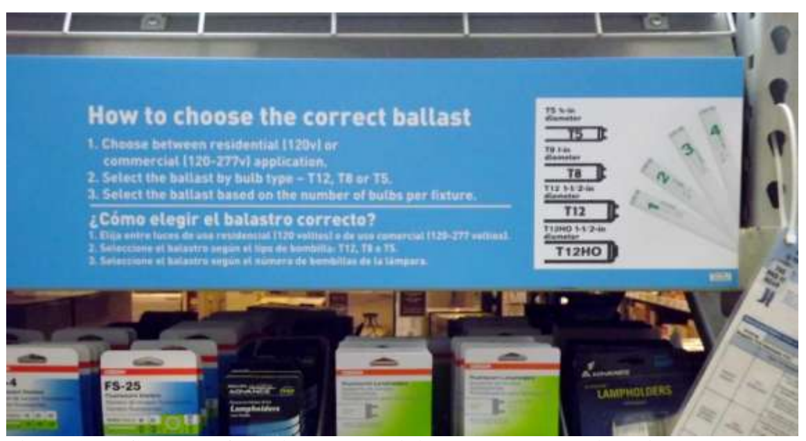
Figure 1.3 – Close-up of the signage pertaining to ballast selection. Although it mentions the difference between residential and commercial ballasts, the difference appears to be based only on voltage. It makes no mention of FCC Part 18 rules or the potential for radio interference. The consumer would have no way of knowing that a commercial device should not be used in a residential environment.

The store display is shown in Figure 1.2. There is no indication of Part 18 FCC requirements. Figure 1.3 also shows a close-up of the display signage pertaining to the selection of ballasts. Although it tells customers to select commercial and residential ballasts accordingly, it does not