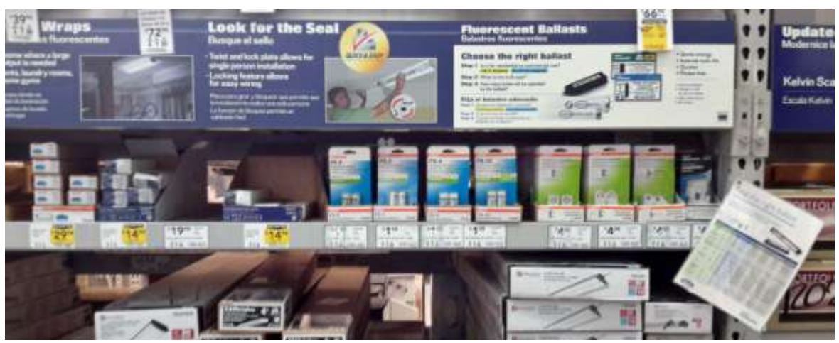
Figure 4.2 – The information provided by Lowe's at this Connecticut store is essentially the same as at other Lowe's stores that we investigated. Refer to Figures 1.3 and 1.4 for similar signage and info sheet that we found at the Massachusetts store in E. Springfield.

The information provided by Lowe's to its customers is clearly inadequate to properly advise them with regard to Part 18 rules. This is similar to the other Lowe's stores in this report. There is no clear reference to FCC Part 18 requirements when selecting a ballast, and the package labeling only references compliance with Part 18A, which would be meaningless to most consumers and Lowe's customers.