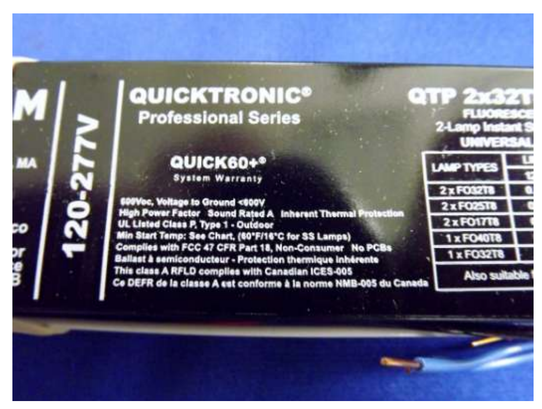
Figure 1.7 – When Ms. Roy opened the box at home, there was no information for the user as required by Part 18. In fact, there was no additional instruction sheet or documentation. The only reference to Part 18 inside the box was on the device itself and shown in this photo.