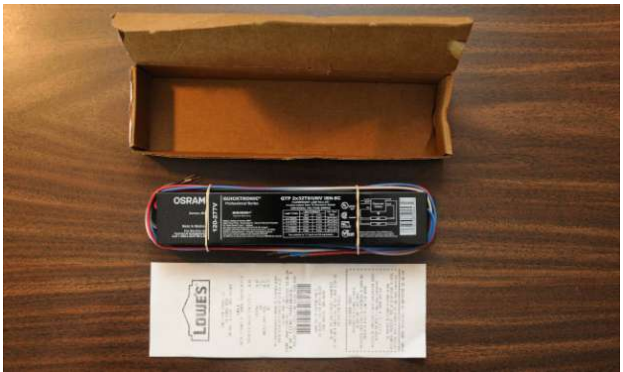
Figure 3.4 – Inside the box. FCC rule § 18.213 (d) requires manufacturers of RF lighting devices to include an advisory statement on product packaging or in documentation. This statement describes and addresses the device potential to cause radio interference. Although small print on the ballast indicates, "Complies with FCC 47 CFR Part 18, Non-Consumer No PCBs," the required advisory statement was not included on the product packaging. There was no documentation included with the device in the box. This is a labelling violation on the part of the manufacturer.