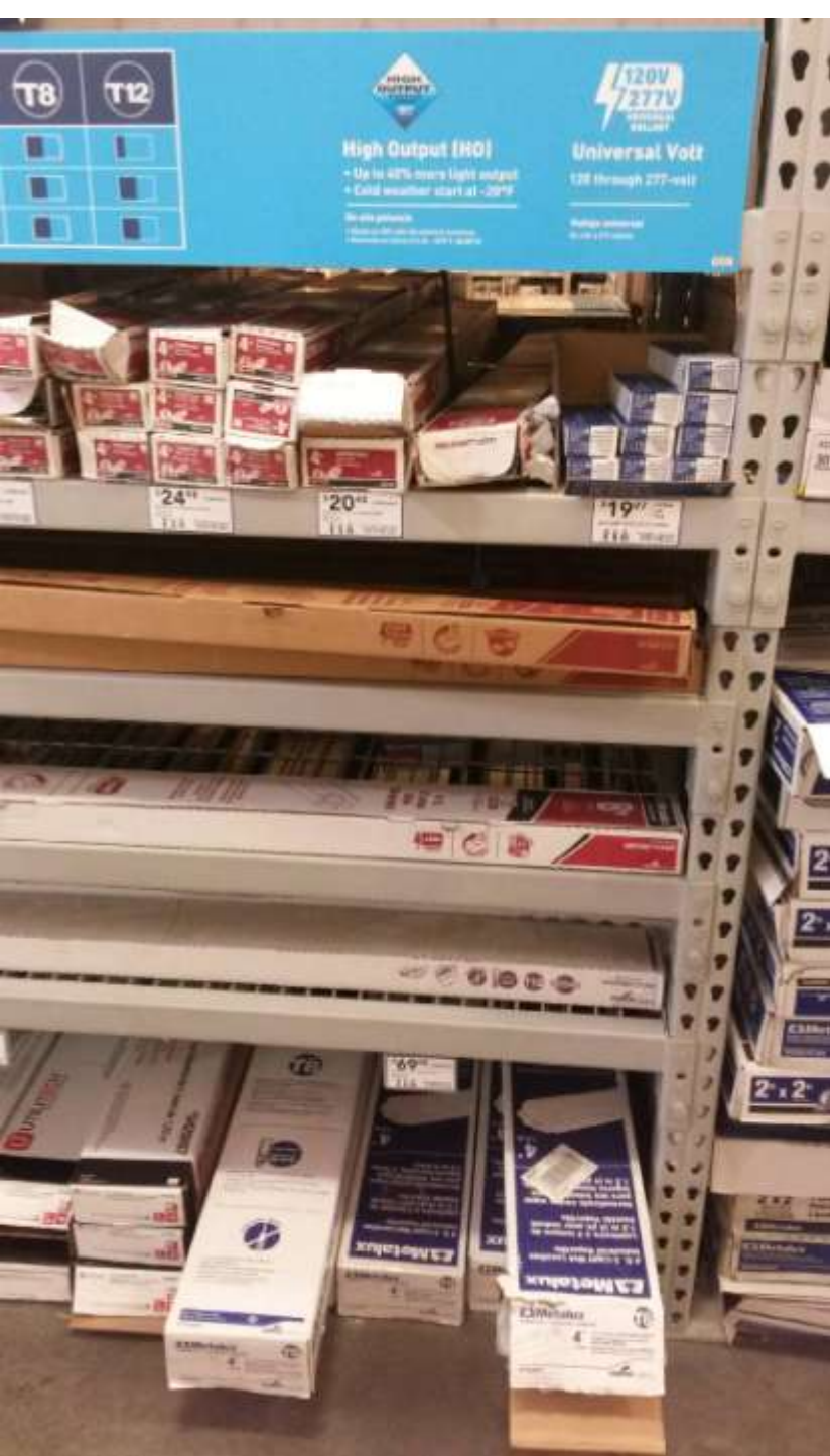
Figure 2.1 - Right side of lighting display at Lowe's on Ridder Park Drive in San Jose, California. Commercial and consumer devices are mixed and intermingled. See text at left of photo for detailed description.

Commercial and residential lighting fixtures are also on the same shelf and adjacent to each other. Two blue Metatech commercial fixtures are pulled out at bottom-right. The red Utilitec residential fixtures are at the lower-left in the photo.