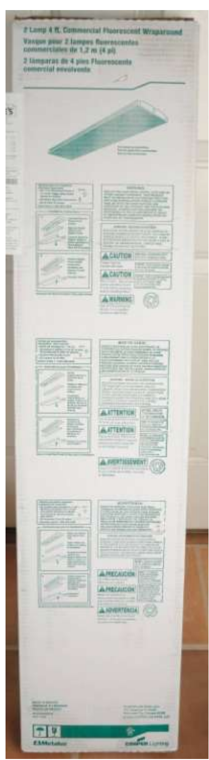
Figure 2.4A – Back view. sales receipt.