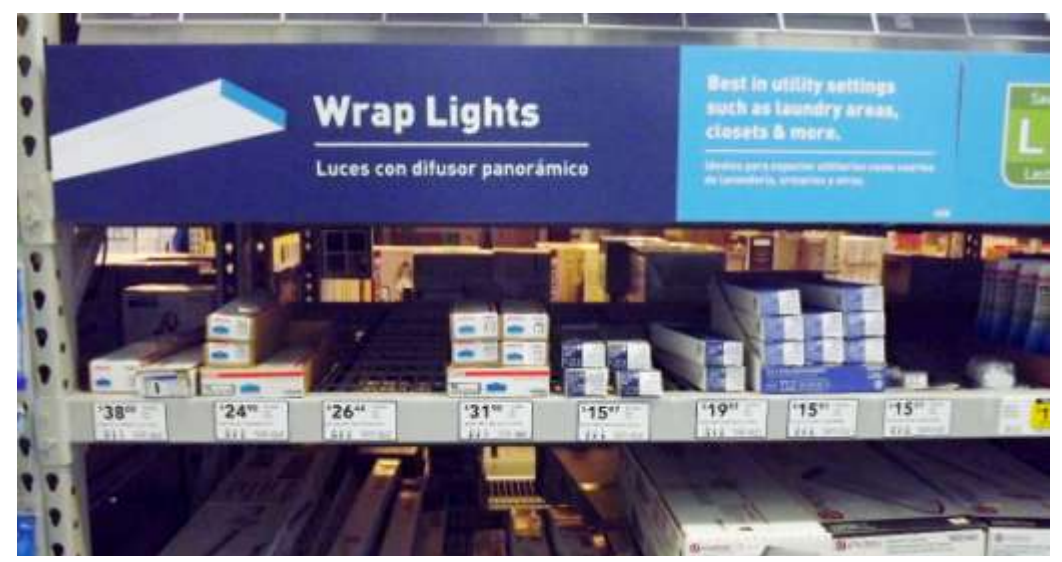
Figure 1.1 - Ballasts on display. Commercial ballasts with orange stripe are on the left. Residential ballasts with blue labelling are on right.

As can be seen in Figure 1.1, the consumer and non-consumer ballasts in this store were in a somewhat apparent order. Non-consumer ballasts were on the left. Consumer ballasts were on the same shelf and to the right of the non-consumer ballasts. The ballasts were adjacent to each other and differentiated by a color scheme. Packaging with blue labels with white lettering were for residential environments. An orange stripe on the box indicated a commercial device. (A quick survey of several samples showed the ratio to be about 50/50.) Although this color scheme made it easy to tell commercial from residential ballasts, it wasn't clear why a consumer would select one over the other. In fact, the commercial rating to most consumers might suggest a heavier duty or better quality product. See Figure 1.2 for photo of store display.