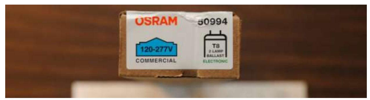
Figure 3.2 – This is the commercial ballast incorrectly recommended by a Lowe's associate for residential lighting purposes.

As in the other Lowe's, the display intermingled residential and commercial ballasts and fixtures. The orange striped box at the left holds Osram (Sylvania) 50994 commercial T8 ballasts for powering two 4' T8 tubes at 32W each (F32) from 120-277VAC. The blue GE residential ballast at right powers the same compliment of tubes from 120VAC mains only for $15.97 each.