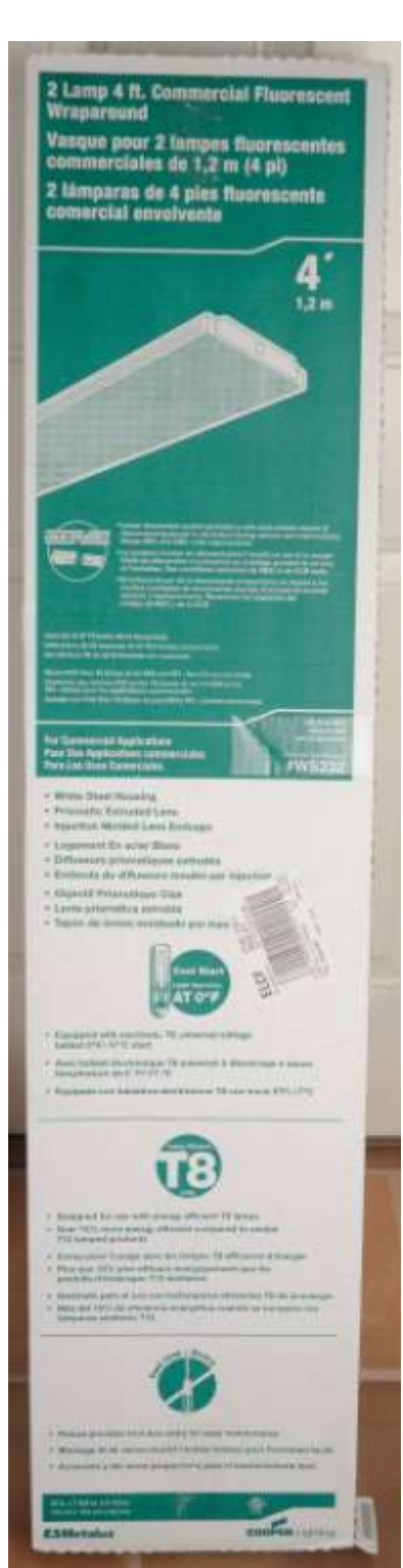
Figure 2.4B – Front view.