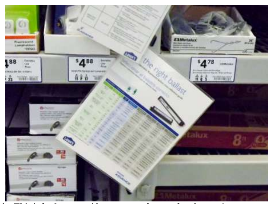
Figure 1.4 – This info sheet provides a cross reference for electronic ballasts when replacing older magnetic ballasts. It does not provide any information on the FCC rules pertaining to Part 18.

specifically tell them not to use a commercial ballast in a home. Consumer ballasts, on the other hand, are clearly labeled for residential use only. The customer is left with the impression that the commercial ballast is a superior or heavier duty product. A relatively small info sheet attached to the display provided a cross reference of magnetic ballasts to the newer electronic ballasts. See Figure 1.4.