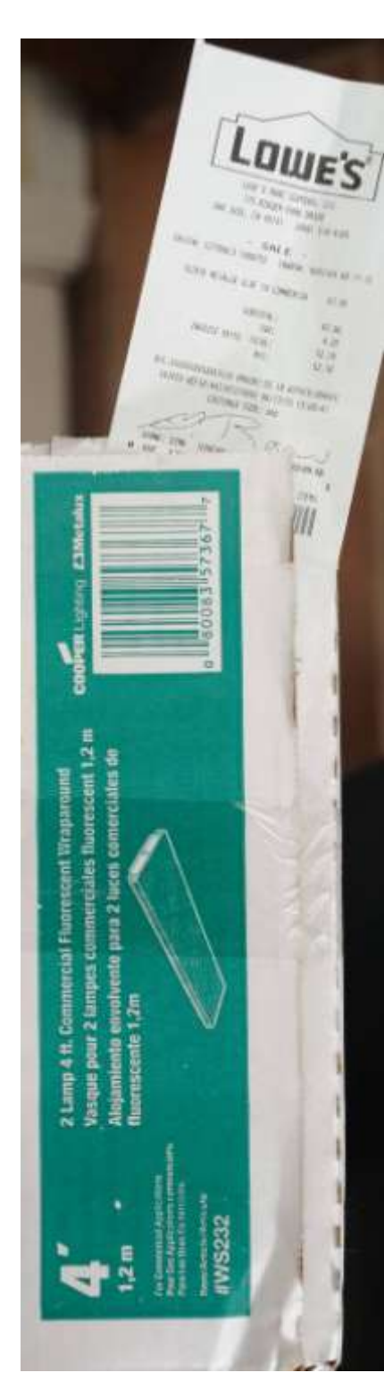
Figure 2.4C - End view with