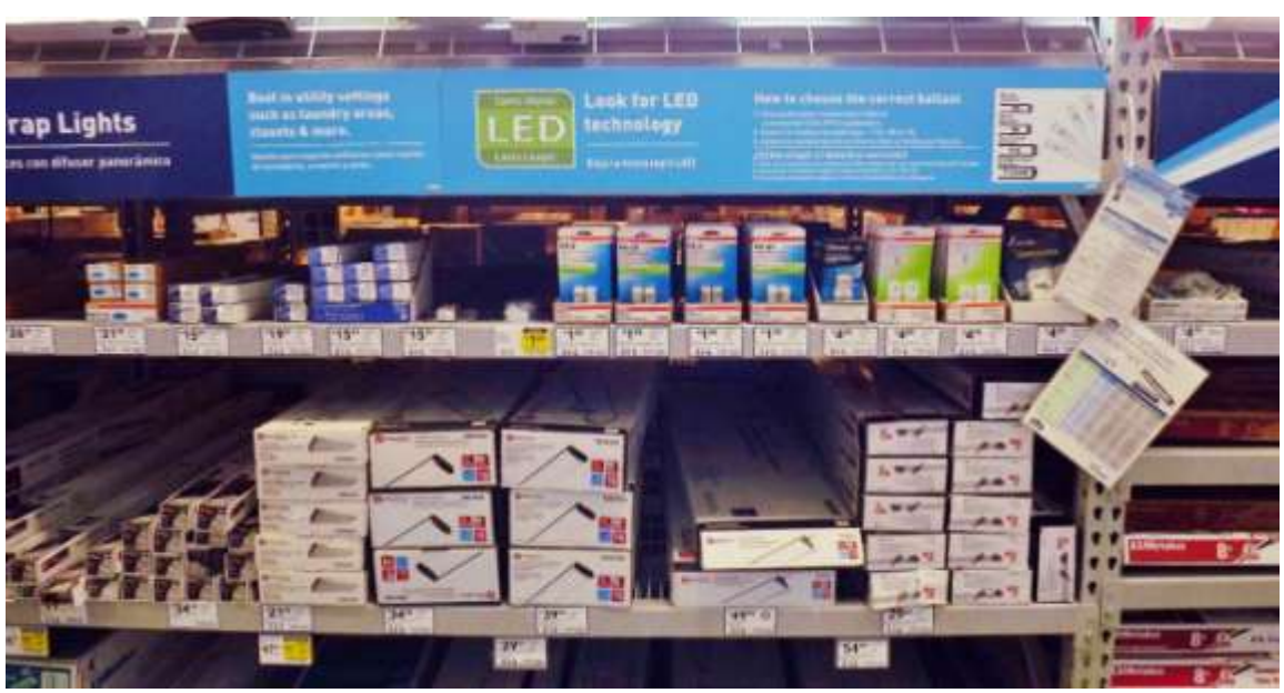
Figure 1.2 – The store display. The ballasts are on a shelf above the fixtures. The store signage on the right provides information on how to choose a ballast but makes no mention of the FCC rules, Part 18, or the potential to cause radio interference.

meaningless to most of the customers that purchase these devices. The typical consumer would not know the significance of the non-standard references to the Part 18A and Part 18B ratings.