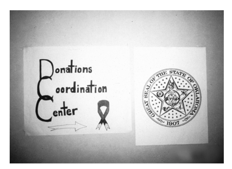
The Oklahoma State Donations Coordination Center provided much needed space for voluntary agencies to meet with their State and local counterparts to discuss donations coordination issues throughout the intensive response period following the Oklahoma City Bombing. Some 5,000 calls were taken by the State-FEMA donations phone bank alone.