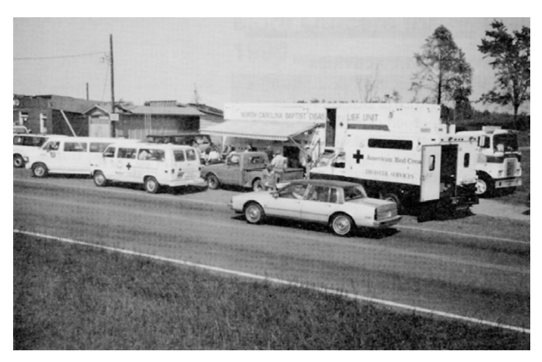
After a tornado hit Cooksville, North Carolina, in the Spring of 1989, cooperation was the key to successful disaster response. The Salvation Army van and two American Red Cross vans were stocked by the Baptist mobile kitchen. The communication unit provided by the American Radio Relay League kept it all flowing smoothly.

Effective voluntary agency collaboration benefits both the providers and the recipients of disaster assistance by allowing services to be provided in the most effective manner possible while reducing duplication of benefits between the responding agencies. When collaboration is working well, expertise and resources are shared between voluntary agencies, the government, and private businesses. This collaboration among disaster relief organizations increases creativity, responsiveness, and the ability to draw on varied resources in order to assist individuals and families in their recovery from the disaster.