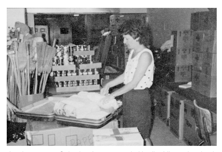
A volunteer at a Salvation Army center in Hardin, Missouri, unloads health kits from Church World Service Disaster Response. In the background you can see comfort kits and cleaning supplies that were donated from the American Red Cross.