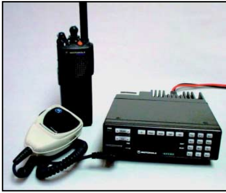
Figure 5—Motorola APCO 25 mobile and hand-held transceivers.

voice quality of the APCO 25 system on a scale from zero to five, Harold said: "It's near a five when you're in range. When traditional analog modes are getting noisy, the APCO 25 radios remain virtually noise-free." Testing by users shows that the coverage area is consistently greater when operating in digital mode than in analog mode, although quality tends to fall off rapidly at the extremes of the coverage area.