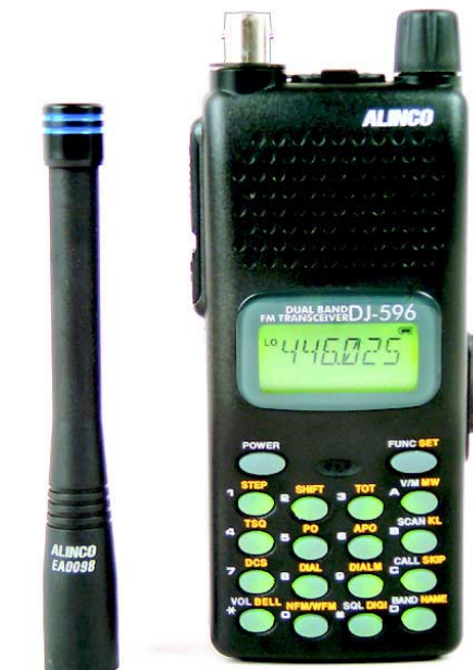
Figure 6—Alinco DJ-596 transceiver.