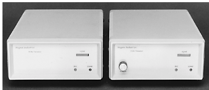
Figure 4—WK6F's remote-control units.

Harold Reasoner, K5SXX, reports that the Fort Worth chapter of the Texas VHF-FM Society gained access to APCO 25 mobiles and hand-helds for testing purposes through its relationship with MARC. The Quantar repeater operates in both digital voice and traditional analog voice modes. When asked to rate the