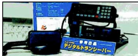
Figure 7—Prototype digital radios shown recently in Japan.