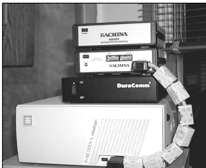
Figure 2—505RC remote-control setup.