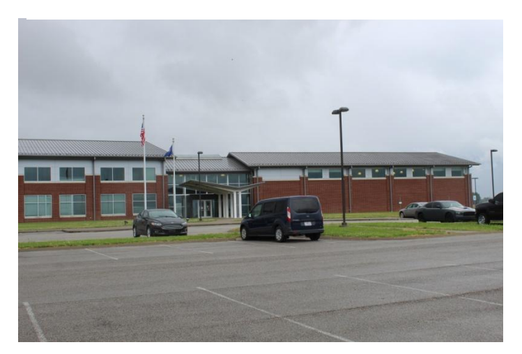
Figure 4 National Guard Armory - Daviess Co Dist 2 office