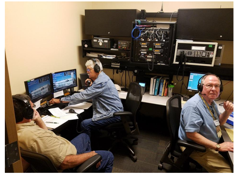
Figure 1 Frankfort KY4EOC CREW

If the exercise takes place in the future, there are many aspects of the exercise that never developed. It is hopeful that this may be developed in the future. It was my intent to only use the digital modes, such as DMR, Fusion and DStar for logistical and coordination use for the exercise. What happened during the exercise, all of normal operating channels