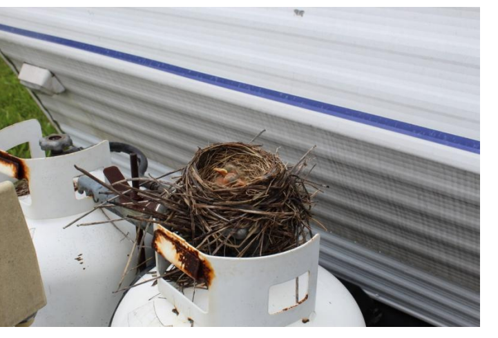
Figure 5 Hope our non-feathered friends can fly before FD. 3 baby chickadees