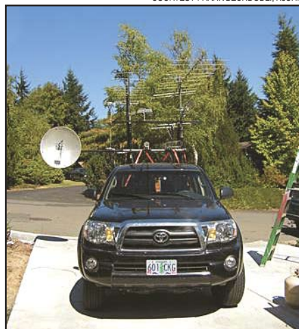
The K3UHF rover station with microwave extension — please pass on the left!

• Keep the Rotator Turning — Most VHFers use highly directional beams, so unless both beams are pointed in the right direction, we often can not hear one another. This is especially true for the farther out sta-